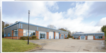
Indicative Image for Information Purposes